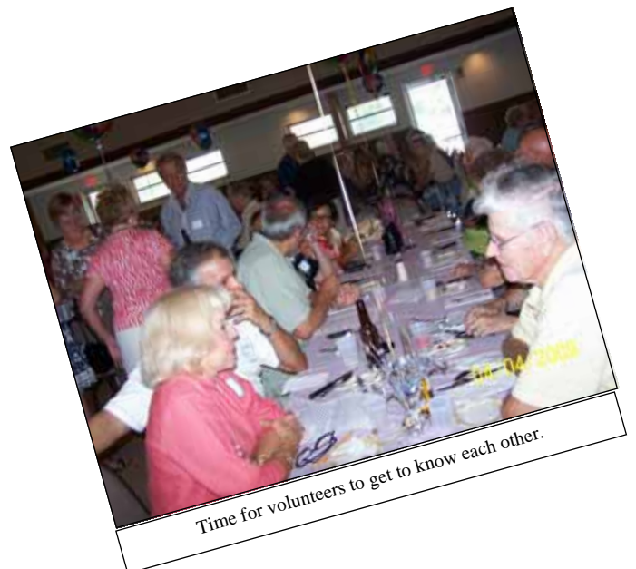
Time for volunteers to get to know each other.