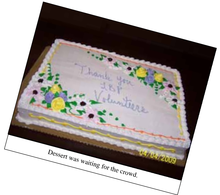
Dessert was waiting for the crowd.