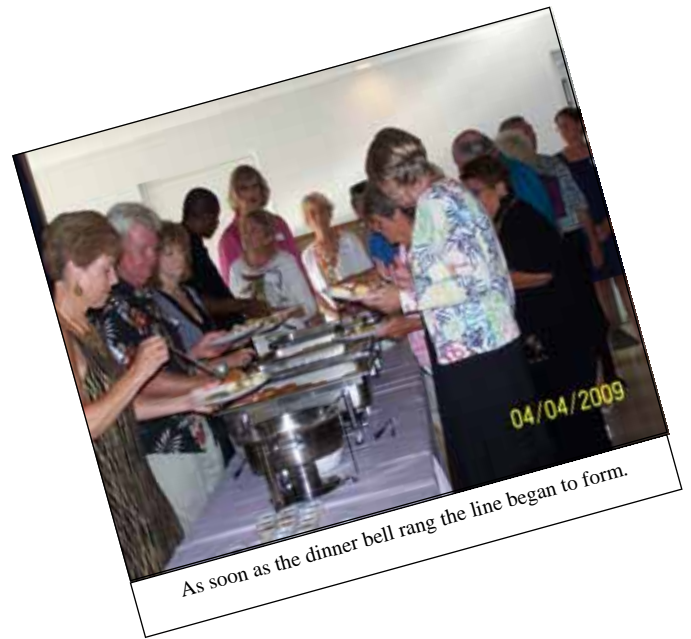
As soon as the dinner bell rang the line began to form.